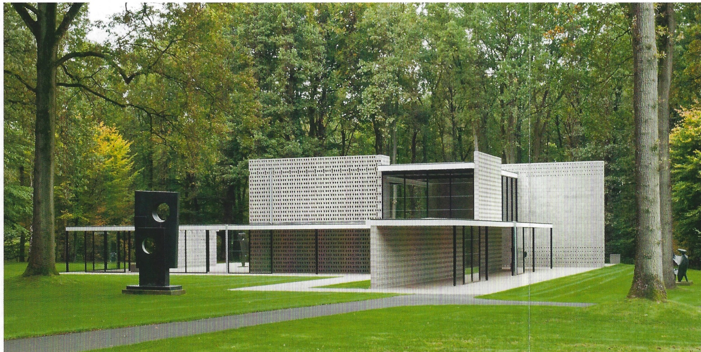
Rietveld Pavilion with work by Barbara Hepworth