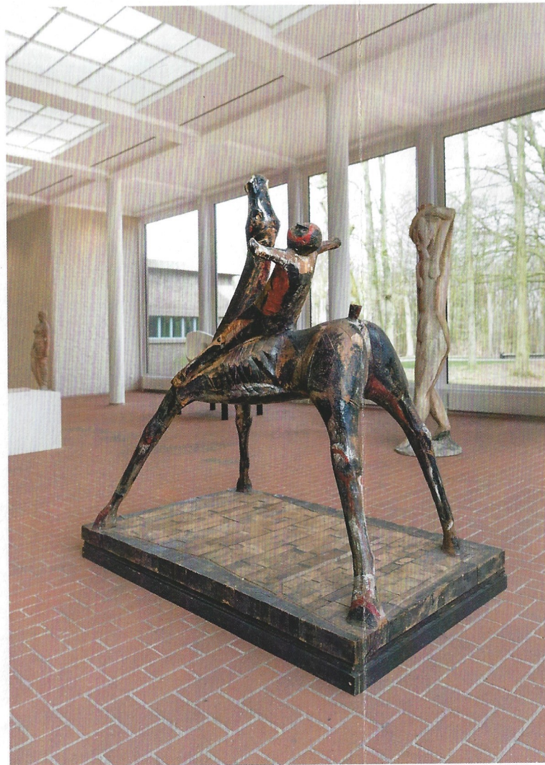
Sculpture gallery with Horse and rider , 1951 – 1955, from Marino Marini in the foreground

The Kröller-Müller Museum is a place where things of beauty come together. The unique combination of art, nature and architecture guarantees visitors a truly unforgettable experience. An experience that arouses all the senses. The museum is a paradise for both seasoned art lovers and objective newcomers. Nowhere else in the world is the enjoyment of art so intense, due to the phenomenal collection and the beautiful location in the heart of nature. With almost 400,000 visitors a year, the Kröller-Müller Museum is one of the most popular museums in the Netherlands. The collections are also a huge international success. Masterpieces on loan attract millions of visitors throughout the world.