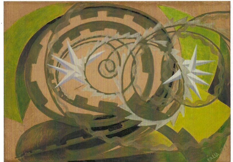
Giacomo Balla, Forms of motorcycle noise , 1913

The Kröller-Müller Museum is a second home to Vincent van Gogh. The museum boasts almost 90 paintings and more than 180 drawings, making it the second largest collection of Van Goghs in the world. In addition, the museum is home to top works by modern masters including Claude Monet, Georges Seurat, Pablo Picasso and Piet Mondriaan. Temporary exhibitions ensure that the museum keeps pace with all the latest developments and retains public interest. New acquisitions ensure a dynamic collection that follows close on the heels of contemporary art history. The entire spectrum; from Vincent to the present day.