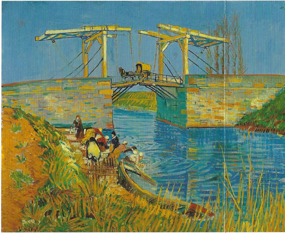
Vincent van Gogh, Bridge at Arles (Pont de Langlois) , March 1888

The Kröller-Müller Museum is the lifework of Helene Kröller-Müller. Between 1907 and 1922, she and her husband Anton Kröller bought almost 11,500 works of art: one of the largest private collections of the twentieth century. It was Helene's dream to have her own 'museum house', a place where she could share her passion for modern art with other art lovers. Helene's dream was fulfilled in 1938, when the Kröller-Müller Museum opened its doors to the public. Under her successors, the museum was extended several times with new buildings and an expansive sculpture garden. The collection grew into one of the leading collections in the field of modern art.