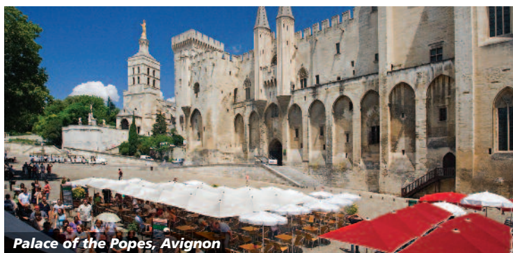
Palace of the Popes, Avignon

While shopping, the general rule is "ne touchez pas," don't touch. Rather, point and let the vendors, some of whom may speak a little English, serve you. They'll tally your bill on a scrap of paper and hand it to you.