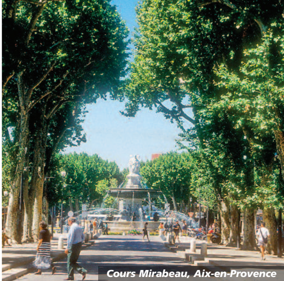
Cours Mirabeau, Aix-en-Provence

All prices quoted are in USD, per person, based on double occupancy and do not include air transportation costs (unless otherwise stated). Single accommodations are available upon request (limited availability).