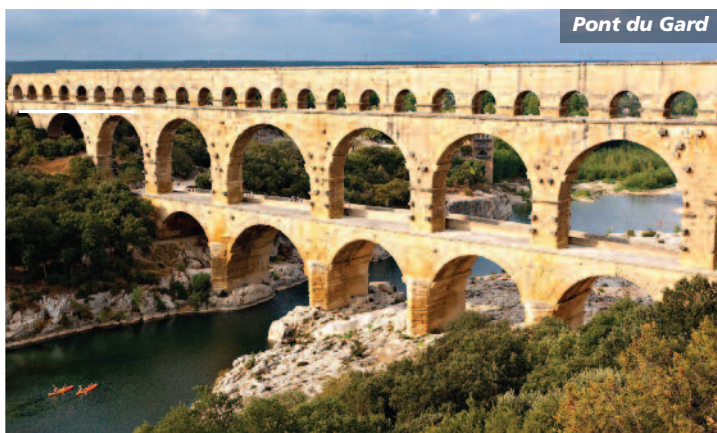
Pont du Gard

Local Flavor: Enjoy dinner at a restaurant in Aix.