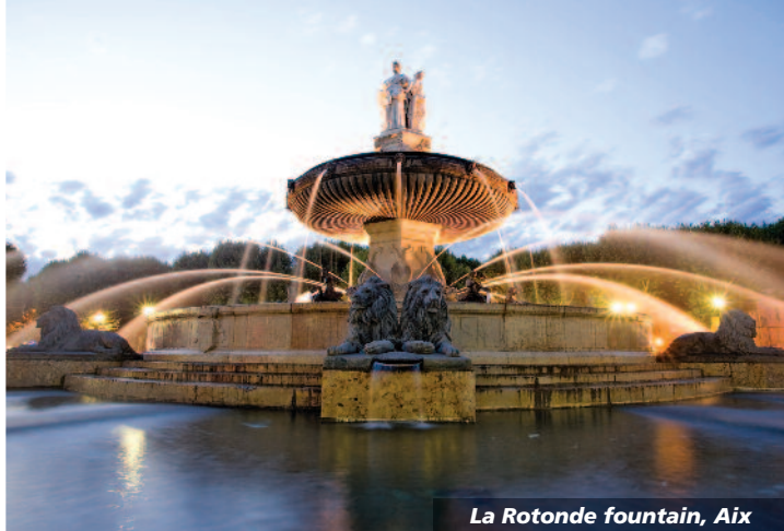
La Rotonde fountain, Aix